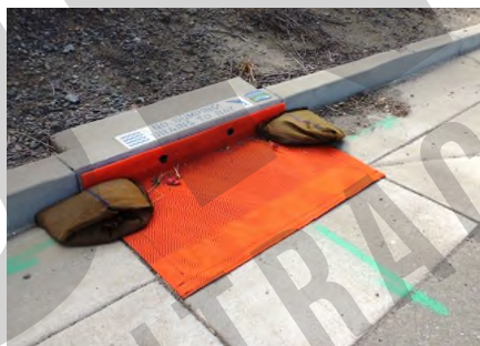
Anchored with Gravel Bags or Zip Ties