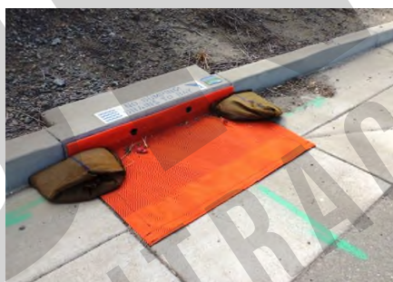
Anchored with Gravel Bags or Zip Ties