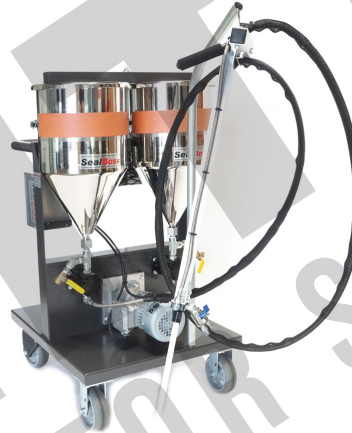
JointMaster Pro2 G3i Digital Two Component Pump