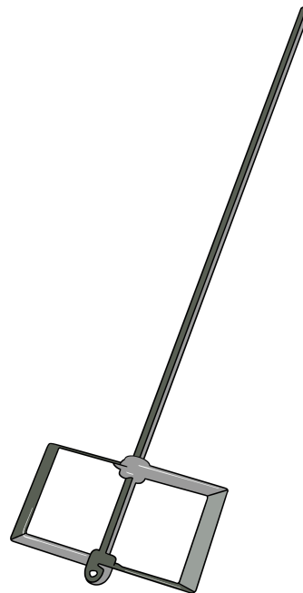
Top: Jiffy Style Paddle Bottom: Mud Mixing Paddle